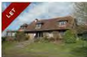
Itchen Stoke Let: £2,500pcm