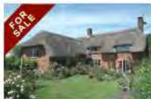
Itchen Stoke Guide Price: £795,000