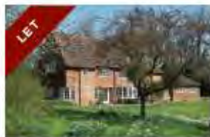
Itchen Abbas Let: £3,350pcm