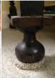
items like a side table. The number

required is simply the number of legs or wheels on the furniture in question. Cut out hardboard or laminate squares of size and number needed. If you have the right tools you can use circles (remember the circles will need to have a larger diameter than the length