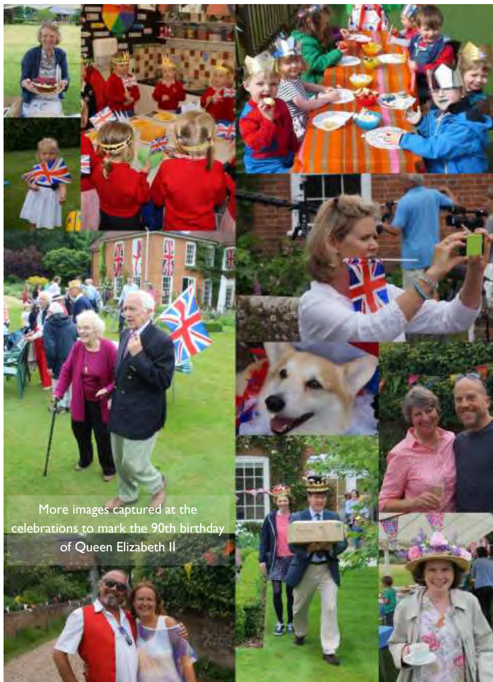
More images captured at the celebrations to mark the 90th birthday of Queen Elizabeth II