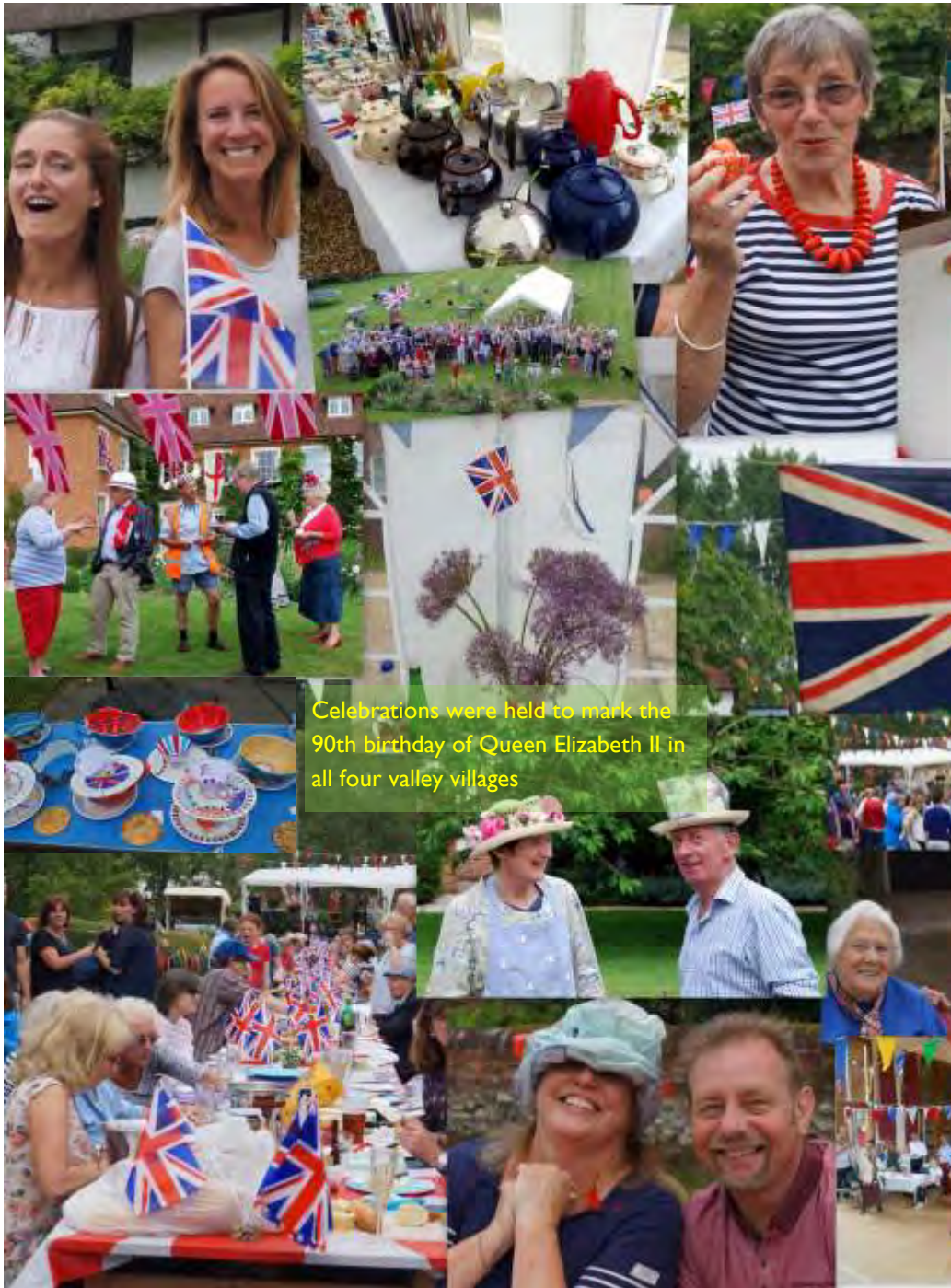
Celebrations were held to mark the 90th birthday of Queen Elizabeth II in all four valley villages