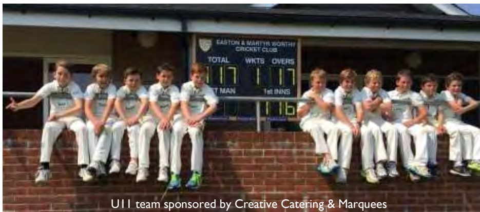
UII team sponsored by Creative Catering & Marquees